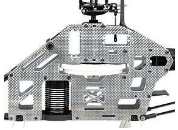
Focus Shot5(425mm fiberglass blades) Focus Shot6(500L Brushless motor)